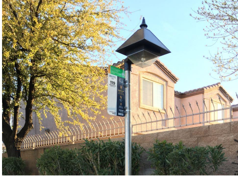
Assembled in Las Vegas at ASE's TUVus Certified Factory